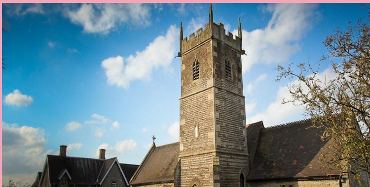
St Michael's, Stoke Gifford, Bristol

The fee for area events is designed to cover UCAN's time/costs in organising the days, venue and catering costs, and a fee for training input. UCAN accounts are shared with members once a year. We do not want cost to be a reason why you cannot come but we hope your church will pay for your training and travel.